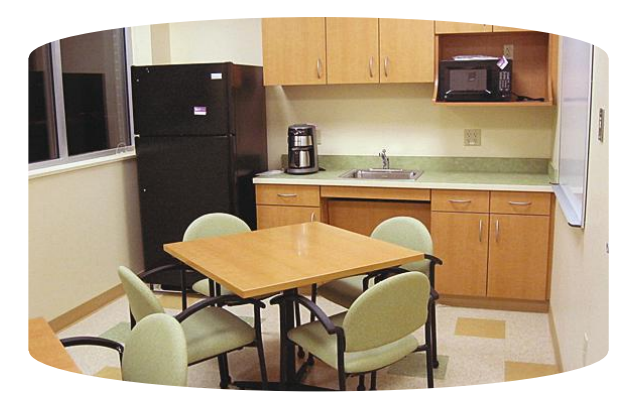
Gaylord National Harbor Hotel