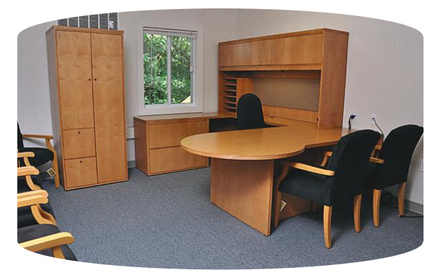
U.S. Chamber of Commerce